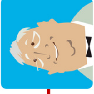
der Opa / der Großvater